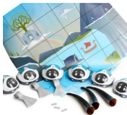
Vikings and Norse Mythology Bundle AV47492