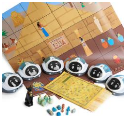
Ancient Egyptian Bundle AV47491