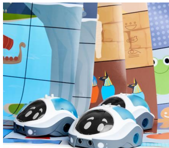
Loti Bot Bundle AV47490

We hope you enjoy using the Loti Mats. If you have a brilliant idea that you would like to share with us, please get in touch.