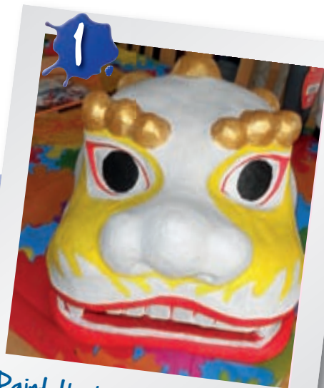
1 Paint the head white...

Paint the head with a couple of layers of white acrylic paint or Gesso. This will make the other acrylic colours or Decopatch paper you use to decorate the head much brighter. Paint chosen areas with acrylic paint to add detail and colour eg. Eyes, mouth, horns etc