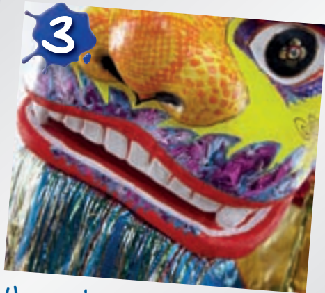
3 Use a selection of collage...