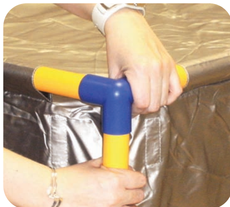
8. Attach the side poles to the top corner connectors