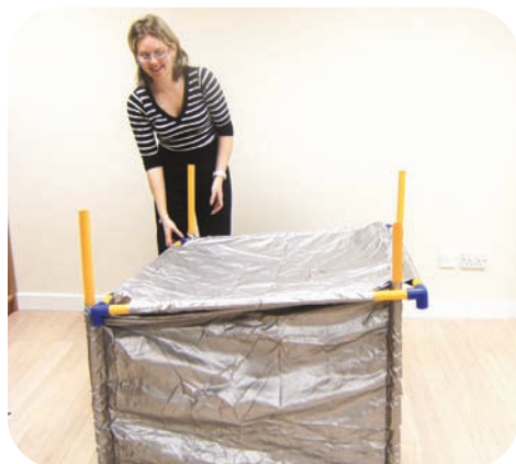
7. Slide the remaining 4 poles into the sleeves at each corner and attach to the bottom.