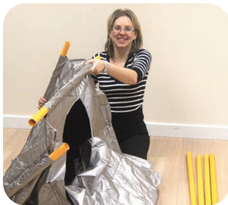
2. Slide the pole into each of the sleeves on the top of the den.