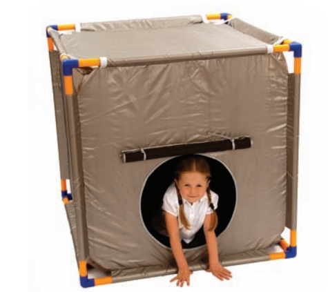
9. The completed den will look as above.