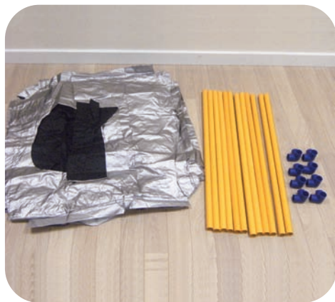
1. Sort the different parts ready for assembly.

There is a full range of support materials for the Dark Den, from lighting to textured and sensory play materials. Log on at www.tts-shopping.co.uk for inspiration and ideas to get the most from your Dark Den activities.