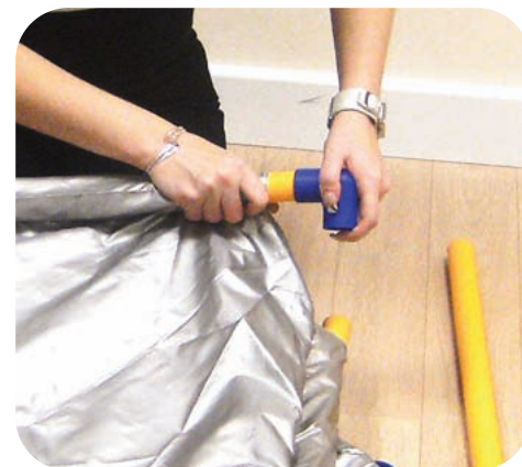
6. Connect the poles with corner connectors.