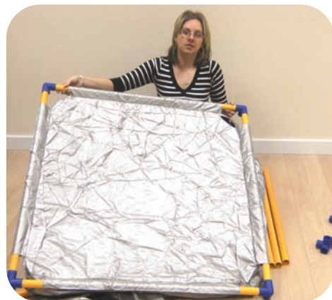
4. Turn the den over.